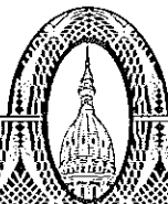
Rick Snyder Governor