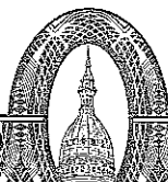
Rick Snyder Governor

A handwritten signature of Rick Snyder in black ink.