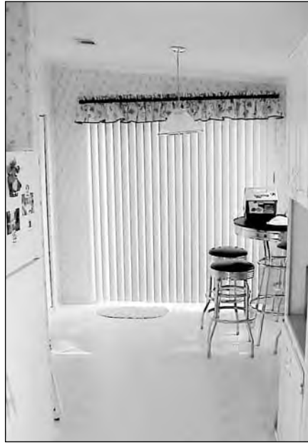
This kitchen has a vinyl floor covering and an overhead supply register. Mold can occur under the vinyl that is washed by cold air from the register.

It is common practice for manufacturers to use vinyl-covered wallboard as the interior finished surface. This is one of the most economical finishes that can be applied and meets the vapor retarder requirement. The Manufactured Housing Institute tested the wallboard with