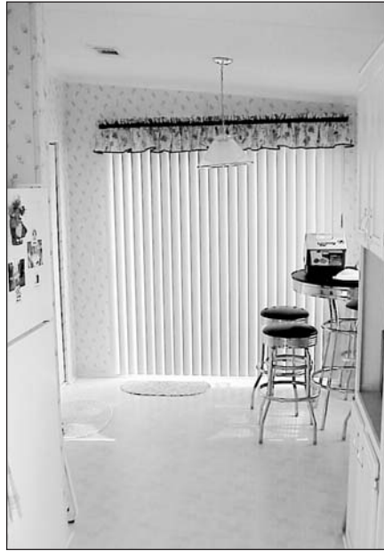
This kitchen has a vinyl floor covering and an overhead supply register. Mold can occur under the vinyl that is washed by cold air from the register.

It is common practice for manufacturers to use vinyl-covered wallboard as the interior finished surface. This is one of the most economical finishes that can be applied and meets the vapor retarder requirement. The Manufactured Housing Institute tested the wallboard with